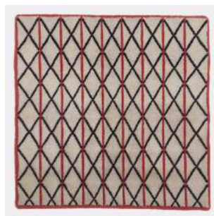
black crossing lines with red vertical lines and borders