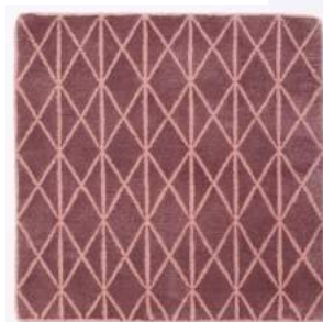
pink lines on a purple background