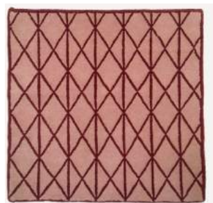
dark red lines on a pink background