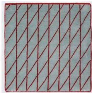
dark red lines on a light blue background