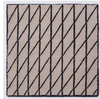
black lines on a light grey background