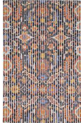
Persian Lines 170 x 240cm / C 52B1