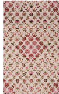
Polka Dots 165 x 275cm / C 52A2