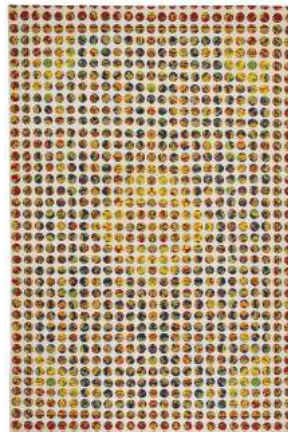
Polka Dots 200 x 300cm / C 52A3