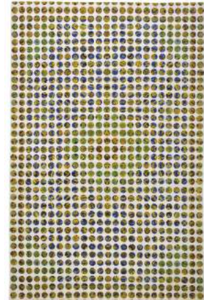
Polka Dots 200 x 300cm / C 52A4

'This are the superimposition of a familiar graphic design from the 1960s and 70s - used in industrial applications like aluminium sheeting, rubber linoleum and ceiling panels - with a colorful Oriental rug. Two different cultures far apart in time and space illustrate how a traditional ethnic repertory can be integrated into contemporary visual language. Sophisticated manufacturing intensifies the effect'.