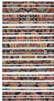
Barcode 90 x 175cm / C 52C